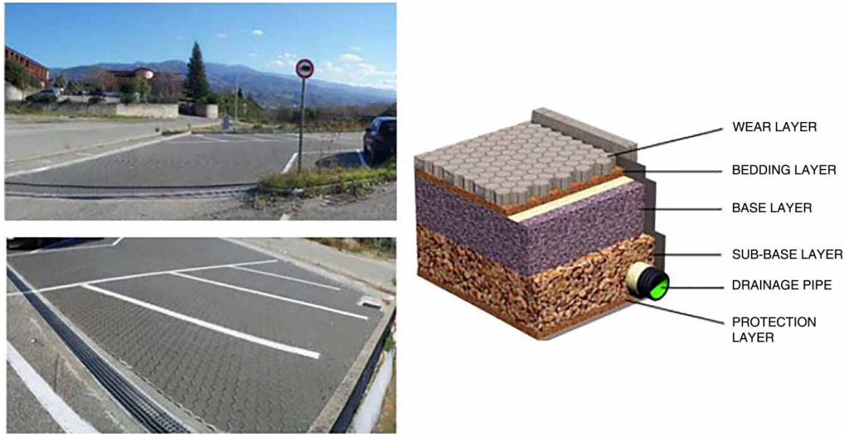
Figure 9 | The permeable pavement experimental site at University of Calabria.

pavement, and the other left impermeable for use as a reference. It has an average slope of 2%, and a total profile depth of 0.98 m. The surface wear layer consists of porous concrete blocks characterized by high permeability (8 cm depth); while the base layer (35 cm depth); sub-base layer (45 cm depth) and bedding layer (5 cm depth) were defined by following the suggestions of the Interlocking Concrete Pavement Institute (ICPI), which recommends certain ASTM stone gradations. In order to evaluate the hydraulic behaviour of the permeable pavement, a reservoir element model was developed in Turco et al. (2018) . In this study, the model was calibrated and validated against measured runoff collected on the specific experimental site described here.