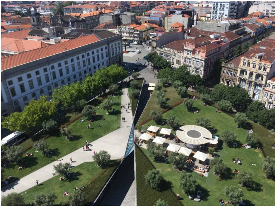
Figure 3 | Example of cities sharing space with vegetation: Green roof at Praça de Lisboa, Porto, Portugal.

Recently, there is an increasing interest in developing more cost-effective green roof design, to use alternative building materials for liners and substrates, to combine greened roofs with solar energy production, and to create multi-purpose recreational space (Figure 3). Several cities are following this trend, and the EU Research and Innovation policy agenda promotes re-naturing cities and territorial resilience for socially and environmentally responsible communities, through the integration of NBS (EU 2015). However, a city's vision for the promotion and use of green roofs varies with the particularities of each place. Given the sustainability of green roofs over their full life cycle, policies are needed that encourage their use through regulation or financial incentives (such as water or property fee reduction), conditional to a pre-defined sustainable development goal attainment. Setting up quality standards for green roofs is important to scale up this NBS, with the German and the Spanish green roof guidelines being good examples for such (NTJ 11C 2012; FLL 2018).