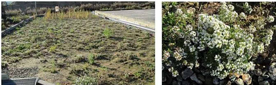
Figure 10 | The stormwater filter experimental site at University of Calabria.

Finally, the stormwater filter experimental site ( Figure 10 ), installed downstream from the permeable pavement, is used to treat stormwater runoff discharged from the adjoining impervious parking lot. It has a surface area of around 125 m 2 , an average slope of 2%, and a total profile depth of 0.75 m, and is covered by a soil substrate vegetated with Mediterranean species. A high permeability geotextile is placed between the soil substrate and the filter layer to prevent fine particles from migrating into the underlying layer. The filter layer is composed of highly permeable gravelly material. Finally, an impervious membrane at the bottom of the profile prevents water percolation into deeper horizons. Based on data collected at the experimental site ( Brunetti et al. 2017 ), the