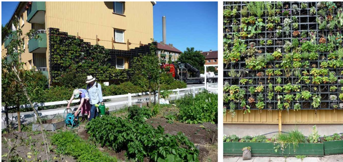
Figure 7 | Seved Edible garden (left); and Seved Edible green wall (right) (photos: Alisa Korolova).

The Seved Edible green wall in Malmö, Sweden was created in 2013 as a pilot project for the demonstration of vertical community gardens (Figure 7). The main idea was to inspire property owners to use the city space in a new way, as in many areas a lack of space does not allow residents to create community gardens or to grow plants in containers. The wall structure, which has a total area of 50 m 2 and a maximum height of 5 m, accommodates edible plants throughout the whole year – with specific plant types replaced depending on the season. The ‘summer wall,’ which includes plants such as strawberries, chard, lettuce, celery, spinach and herbs (oregano, lavender or rosemary), is cultivated from May until November. In November the ‘summer wall’ is replaced by the ‘winter wall,’ which is represented mostly by green cabbages and herbs like oregano and thyme. The selection is mainly determined by the visual aesthetics of the plants, with a preference for those that are bushy and compact – while plants that are especially sensitive to wind are generally avoided.